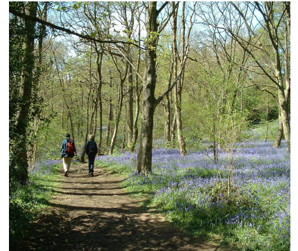
Bluebells at Middleton Woods