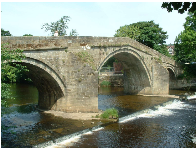
Ilkley Old Stone Bridge