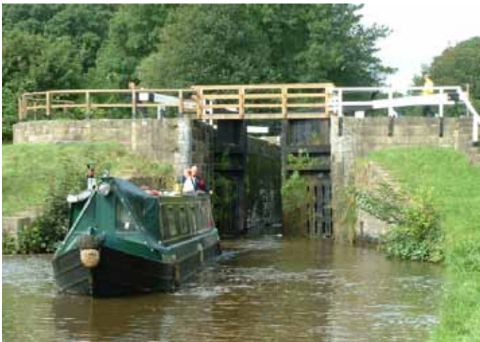
Hirst Wood Lock

The Fair Trade Way is a scenic, circular walking route linking all the Fairtrade villages and towns in the Bradford district: Bradford, Shipley, Bingley, Baildon, Burley, Ilkley, Keighley, Haworth, Denholme and Thornton. Each community supports the Fairtrade principle of "Take a Step" for Fairtrade. For further information visit: www.fairtradeway.org.uk/