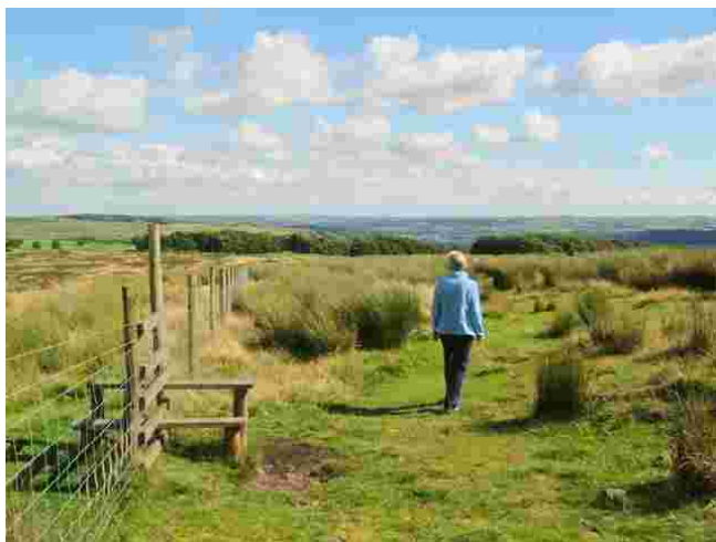
Path near Brass Castle