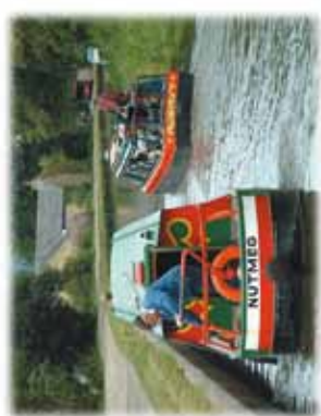
Between Leaches Bridge and Booths Bridge