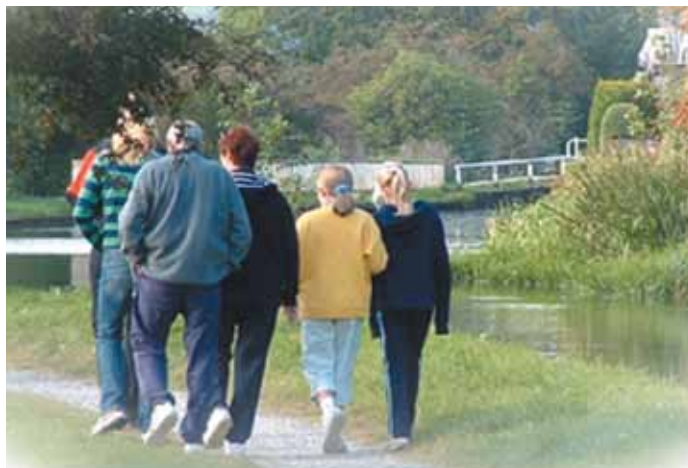
Along the Leeds and Liverpool Canal, Riddlesden

Leeds and Liverpool Canal swing bridge (197) at the top of Bar Lane Riddlesden, near Keighley. Accessed from the B6265 old Keighley / Bradford Road.