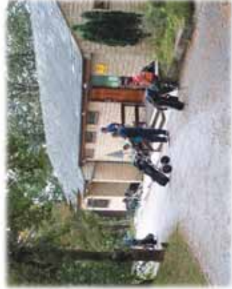
The club house at Riddlesden Golf Course