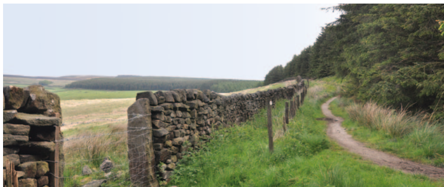
Photo: Gateway in Rivock Edge Forest where the Dew Stones are now installed.

You can approach the same junction from the B6265. At the traffic lights at East Riddlesden Hall, turn right, from Bingley, or left from Keighley, up Granby Lane. Take the second left onto Banks Lane. Follow for 1 mile up the hill to the T-junction with Silsden Road.